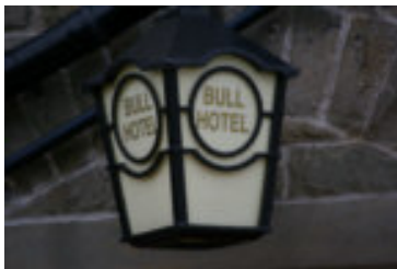
Bare Lane Station House